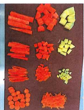
Lola's chopping skills!